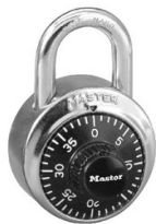
Non Control Key 1502 (Control chart included)