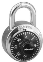
Non Control Key 1500 (No control chart)

Locker locks provide a level of personal security by prevent- ing unauthorized access to your belongings. Whether you're at school, work, or the gym, having a lock on your locker ensures that your valu- ables are safe from theft.